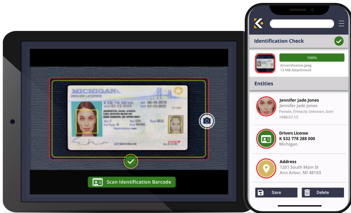
Instant ID Scanning and Automated Data Logging