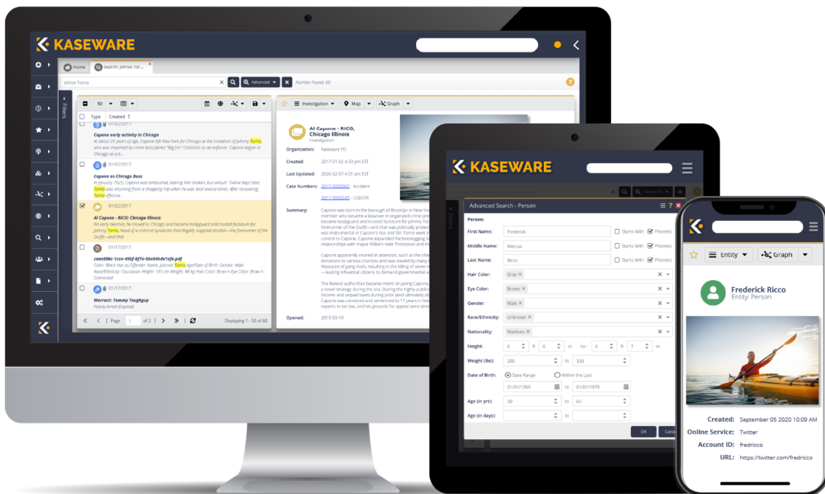
Advanced Case Suspect Search Interface Built With Ext JS