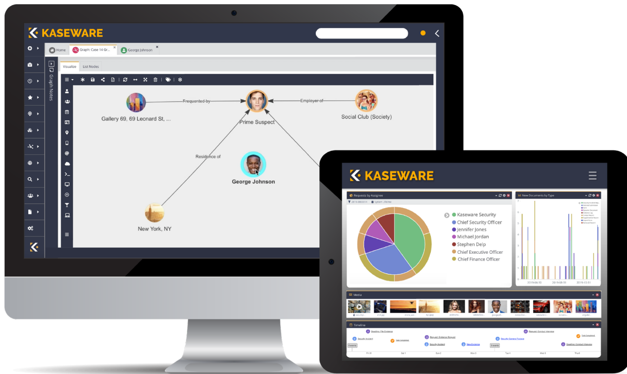
Automated Graphical Link Analysis For Corporate Security Case Management